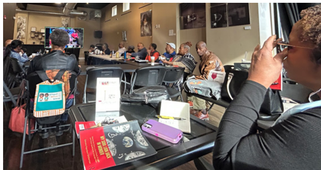
Community classes at the UnBar Cafe located at 12635 Larchmere Blvd, Cleveland, OH