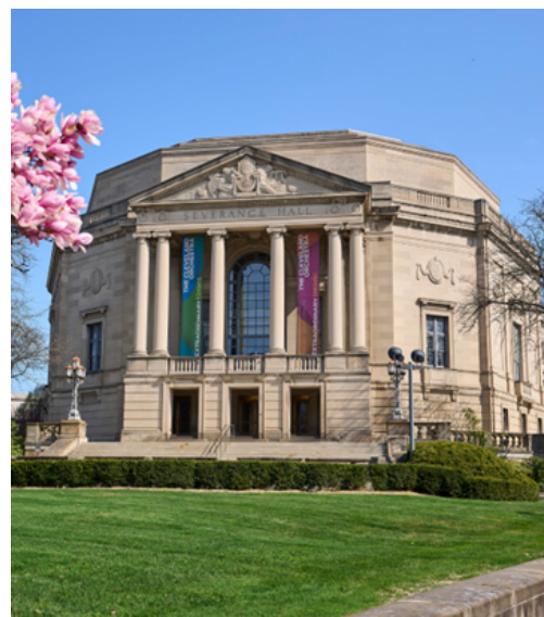
Severance Hall home of the Cleveland Orchestra.

"We offer low individual and group ticket prices and bus subsidies for student matinee performances, and free programming annually on Family Theater Day in May. We offer The Reading Company, a free monthly program with free transportation for families residing in shelters. This includes a performance and books