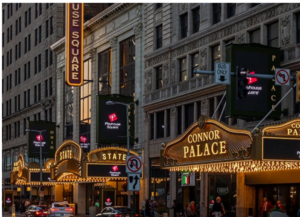
Cleveland Playhouse Square.

These arts institutions are not just tourist destinations but non-profit organizations meant to serve you, the residents. So, take advantage of these free programs or community partnerships. Continue to ask questions about how these institutions, largely funded by your tax dollars, can serve you best. Most importantly, be sure to get involved and enjoy all of the wonderful art and music that Cleveland has to offer, and stay tuned for next month's issue where that examines how The Rock and Roll Hall of Fame and the Cleveland Museum of Art give back to the city of Cleveland