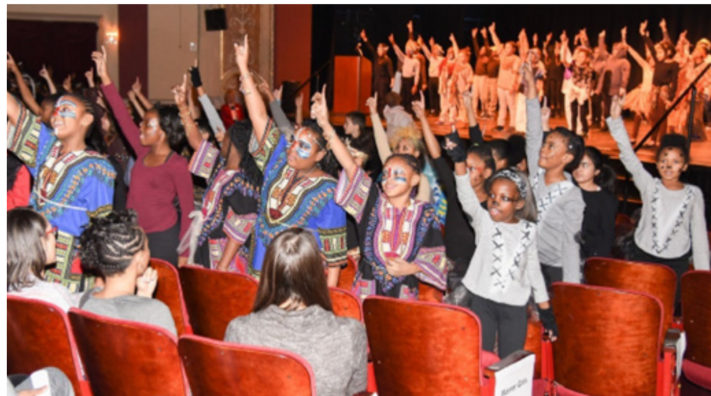
Playhouse Square hosting community student activities.

In Cleveland, four major institutions comprise a large