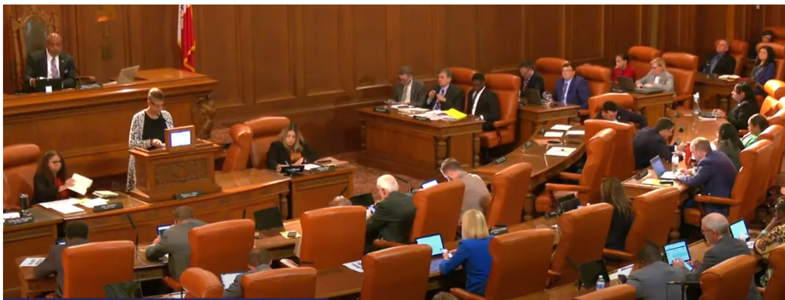
Cleveland City Council meeting of the whole passing legislation.