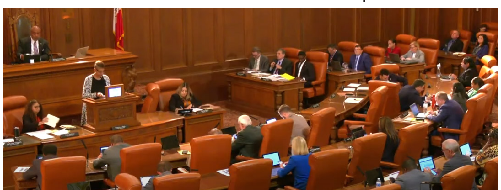
Cleveland City Council meeting of the whole passing legislation.

Purpose: Authorizes the Director of Public Works to employ consultants to manage City-Continued on page 6