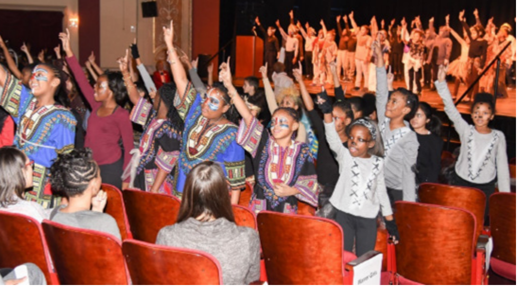
Playhouse Square hosting community student activities.

touristic impact: The Cleveland Orchestra at Severance Hall, Playhouse Square, The Cleveland Museum of Art, and the Rock and Roll Hall of Fame. Public tax dollars fund these core institutions