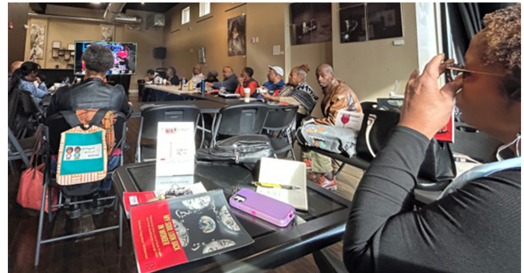
Community classes at the UnBar Cafe located at 12635 Larchmere Blvd, Cleveland, OH