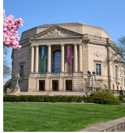
Severance Hall home of the Cleveland Orchestra.

"We offer low individual and group ticket prices and bus subsidies for student matinee performances, and free programming annually on Family Theater Day in May. We offer The Reading Company, a free monthly program with free transportation for families residing in shelters. This includes a performance and books