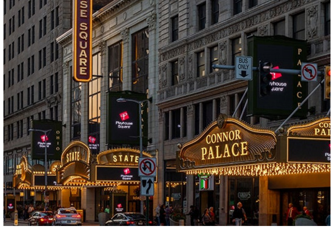
Cleveland Playhouse Square.